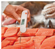
Penetration measurement in fish