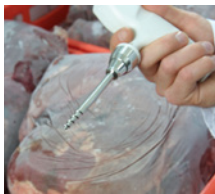
Screw probe for frozen goods