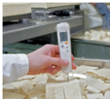
Penetration measurement in cheese