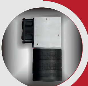
Thermoelectric gas cooler Peltier type with condensate monitoring and alarm