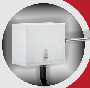
Gas sampling probe HD heated, with ceramic filter and back-purge