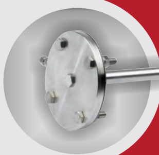
Gas sampling probe LD unheated, with in-situ sintered metal filter