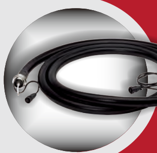
Gas sampling line Teflon, heated with temperature regulation