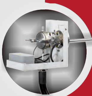
Gas sampling probe HD-GW heated, with borosilicate quartz filter element